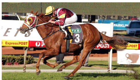
Strike One taking out the Stayers Cup in June 2010.

Highly promising stayer Strike One is likely to be targeted at the Group 1 2011 Stella Artois Auckland Cup in March. The Auckland Cup is run over 3200m with Strike One previously winning over the distance in June last year when taking out the STC Stayers Cup. Strike One has mixed his form a little this campaign and has yet to record a victory but has been impressive with a second in the Gosford Cup and in his most recent start was flying home late when finishing second in the Summer Cup. Strike One has displayed plenty of ability in his Australian career to date having placed twelve times and winning five races in his thirty starts. He has shown he will get the trip and the team at CWR are sure that if he does cross the Tasman he will surely be competitive in Group 1 company.