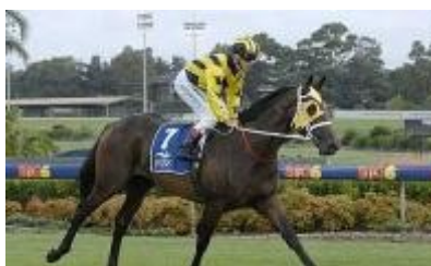
Returning to scale after winning at Canterbury

Iron Lace broke her maiden in her previous start at Hawkesbury when stepping up to 1800m for the first time and put away her rivals for a 2.5L victory.